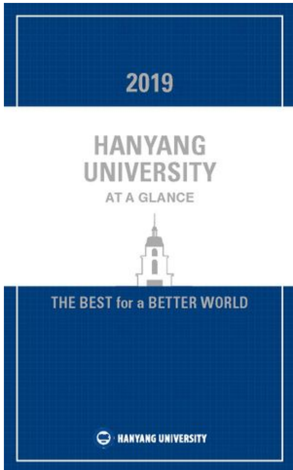
at a glance 2019 cover