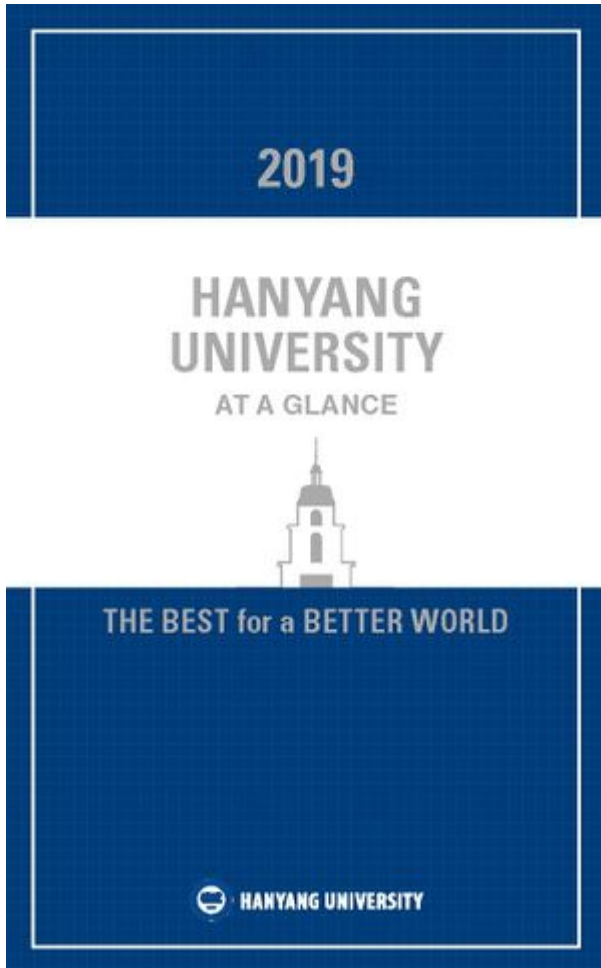
at a glance 2019 cover